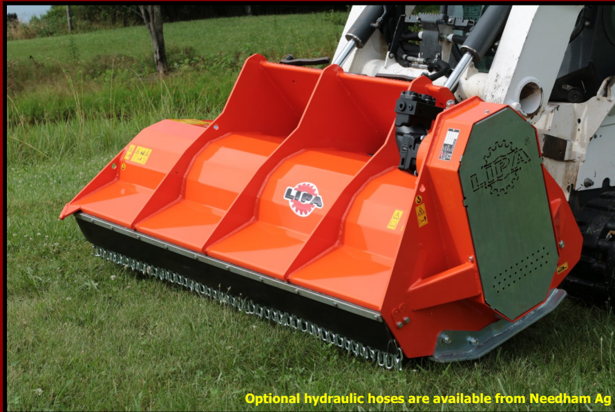
Optional hydraulic hoses are available from Needham Ag

The TLF series is a heavy duty flail mower designed to mow and mulch grass, brush and small trees up to around 2-3" in diameter. They are a preferred design compared to rotary cutters, as they don't propel material everywhere.