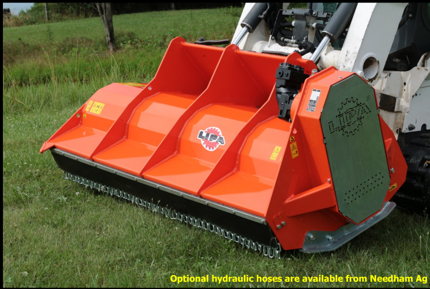
Optional hydraulic hoses are available from Needham Ag

The TLF series is a heavy duty flail mower designed to mow and mulch grass, brush and small trees up to around 2-3" in diameter. They are a preferred design compared to rotary cutters, as they don't propel material everywhere.