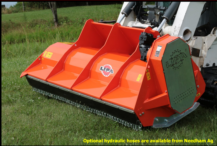
Optional hydraulic hoses are available from Needham Ag

The TLF mowers are designed for larger skid steer loaders, with ideally 60-90 hp, with 18-24 GPM of auxiliary flow (see chart below for specific requirements). Skid-steer loaders with higher flow (more than the flail mower requires), will need flow controlled on the machine.