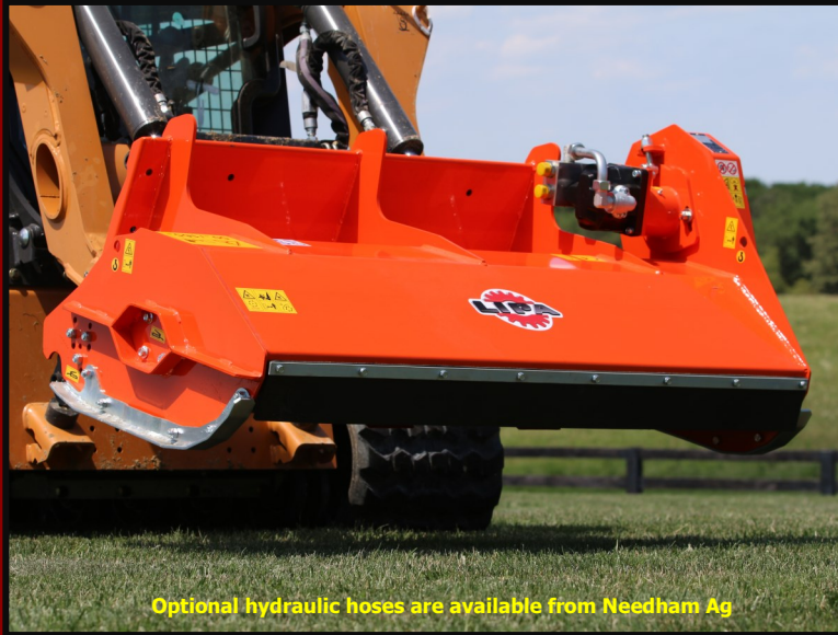
Optional hydraulic hoses are available from Needham Ag

The TLB-F models are designed for smaller to medium sized skid steer loaders which have sufficient auxiliary oil flow (see chart below for required oil flow per minute).