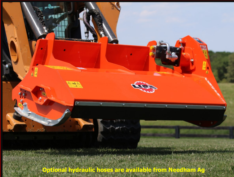
Optional hydraulic hoses are available from Needham Ag

The TLB-F models are designed for smaller to medium sized skid steer loaders which have sufficient auxiliary oil flow (see chart below for required oil flow per minute).