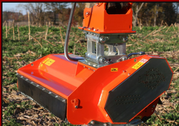
Optional hydraulic hoses are available from Needham Ag