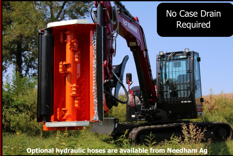
Optional hydraulic hoses are available from Needham Ag

The TLBE-S heavy duty flail mower is perfect for mowing and shredding grass, brush and small trees (up to 2-3" in diameter with the smaller models, and up to 4" with the larger models, or mini excavators with more oil flow). These mowers are designed to work in areas too steep or too unsafe to mow with tractors or skid-steer loaders. The TLBE-S range is designed for larger mini excavators which weigh between around 10,000 and 20,000 lb and those which have sufficient oil flow (see auxiliary oil flow requirements below).