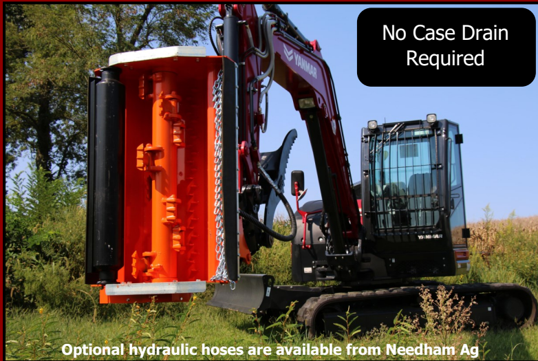
Optional hydraulic hoses are available from Needham Ag

The TLBE-S heavy duty flail mower is perfect for mowing and shredding grass, brush and small trees (up to 2-3" in diameter with the smaller models, and up to 4" with the larger models, or mini excavators with more oil flow). These mowers are designed to work in areas too steep or too unsafe to mow with tractors or skid-steer loaders. The TLBE-S range is designed for larger mini excavators which weigh between around 10,000 and 20,000 lb and those which have sufficient oil flow (see auxiliary oil flow requirements below).