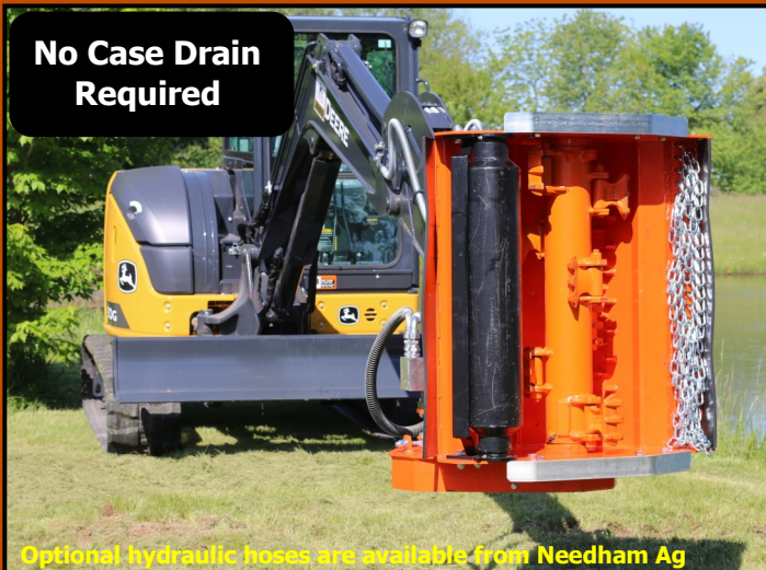
Optional hydraulic hoses are available from Needham Ag

The TLBE-S heavy duty flail mower is perfect for mowing and shredding grass, brush and small trees up to 3" in diameter (but larger diameters are possible with slow and careful operation, especially with soft wood). These mowers are designed to work in areas too steep or too unsafe to mow with tractors or skid-steer loaders. The TLBE-S range is designed for larger mini excavators which weigh between around 10,000 and 20,000 lb and those which have sufficient oil flow (see auxiliary oil flow requirements in chart below).